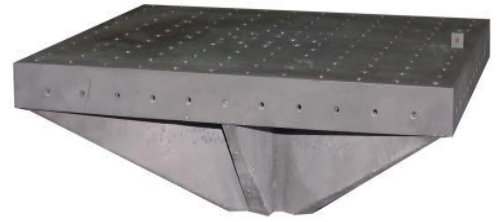
▽ Platform structural analysis

Magnesium alloy die-casting platform, not the general industry use of aluminum and magnesium alloy or magnesium aluminum alloy, magnesium alloy material has the characteristics of light weight and lighter than the common aluminum and magnesium alloy, has good mechanical properties, widely used in aviation, space.